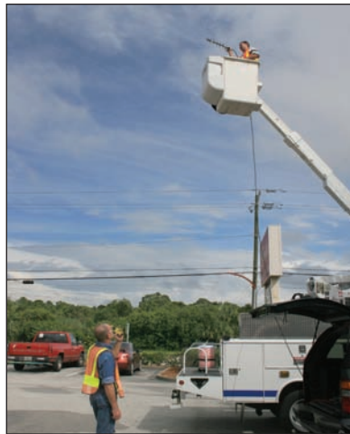
AUTOMATED traffic signal systems are being upgraded to improve traffic flow on major roadways. In another project, 30 roadways are being resurfaced.

OFFICES RELOCATED: Code Compliance (including building permit reviews), Engineering, Personnel, and Risk Management are located at 830 N. Apollo Blvd. during construction of a parking garage near City Hall.