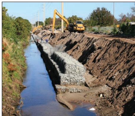
FEDERAL GRANTS allowed the stabilization of a major drainage canal between University Boulevard and Florida Avenue, pictured above, as well as improvements to the canal alongside Edgewood Drive.

The 'Art District Overlay Zone' was finalized in 2008 to allow a live-work environ-