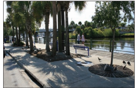
PREVENTING POLLUTION of waterways is the goal of a new ordinance approved in 2008 to prohibit the dumping of materials into drainage structures or surface waters.

Melbourne's rebate program to encourage installation of water-conserving toilets entered its eleventh year and has facilitated the conservation of an estimated 22-million gallons of water. Rebates have been provided