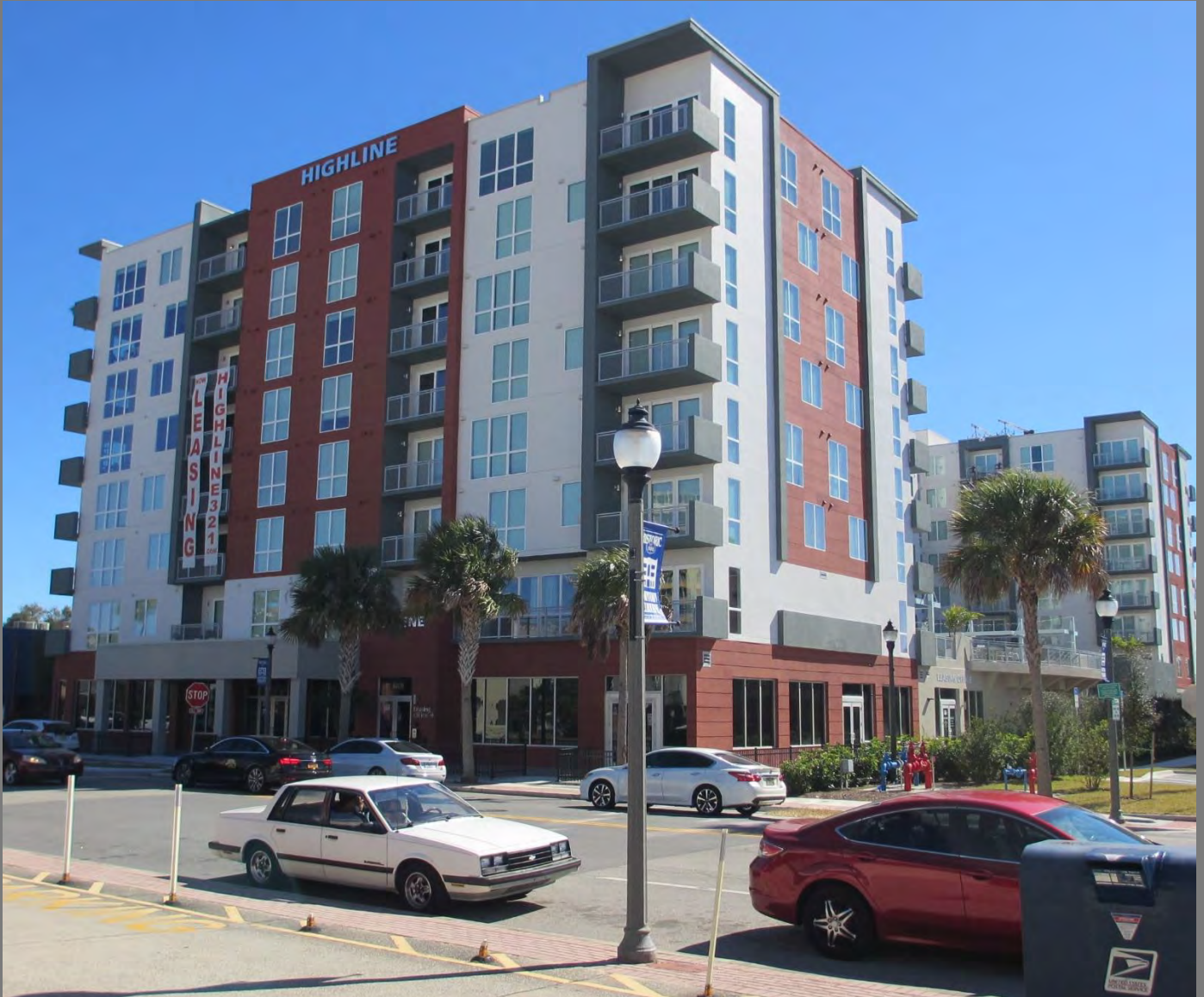
PICTURED ABOVE IS THE COMPLETED HIGHLINE APARTMENT PROJECT