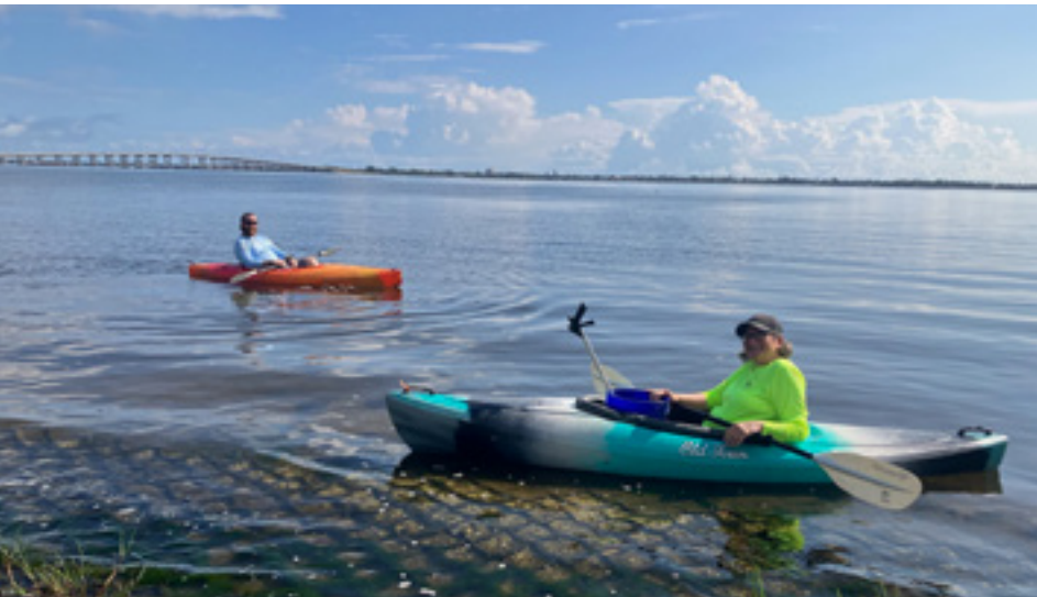
International Coastal Cleanup Volunteers

A new baffle box was installed to treat stormwater runoff from a 151-acre drainage basin located roughly within the boundaries of Babcock Street to the railroad right of way from Babcock Street to Oak Street. Baffle boxes trap debris and pollution from stormwater. They are being installed citywide as part of the effort to keep pollution from going into the Indian River Lagoon.