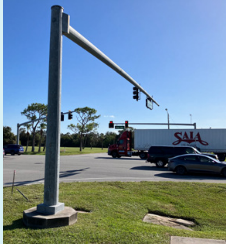
Mast Arm Traffic Signal at NASA Boulevard and Grumman Place