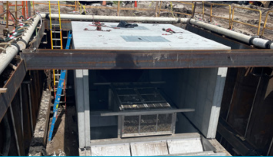
Baffle Box Installation

A new baffle box was installed to treat stormwater runoff from a 151-acre drainage basin located roughly within the boundaries of Babcock Street to the railroad right of way from Babcock Street to Oak Street. Baffle boxes trap debris and pollution from stormwater. They are being installed citywide as part of the effort to keep pollution from going into the Indian River Lagoon.