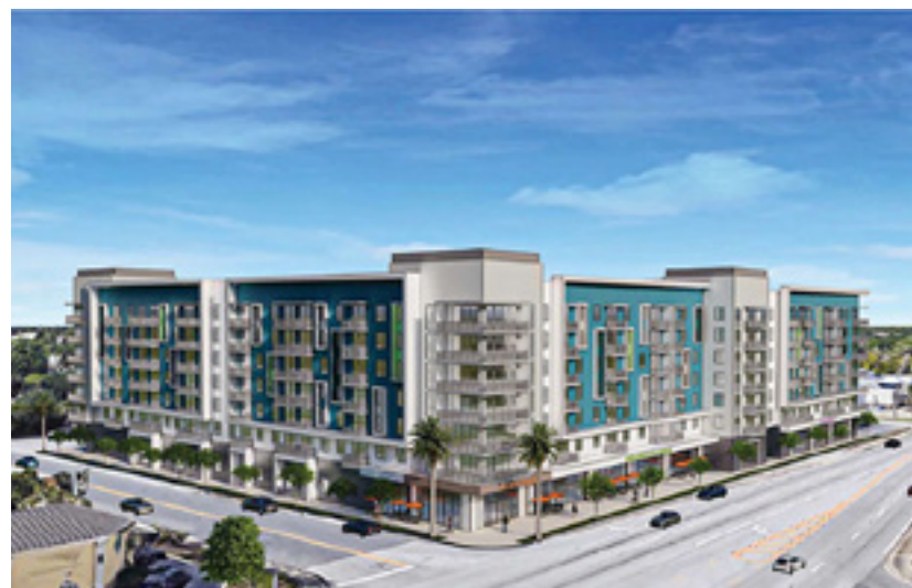
Avery at Eau Gallie (architectural rendering)