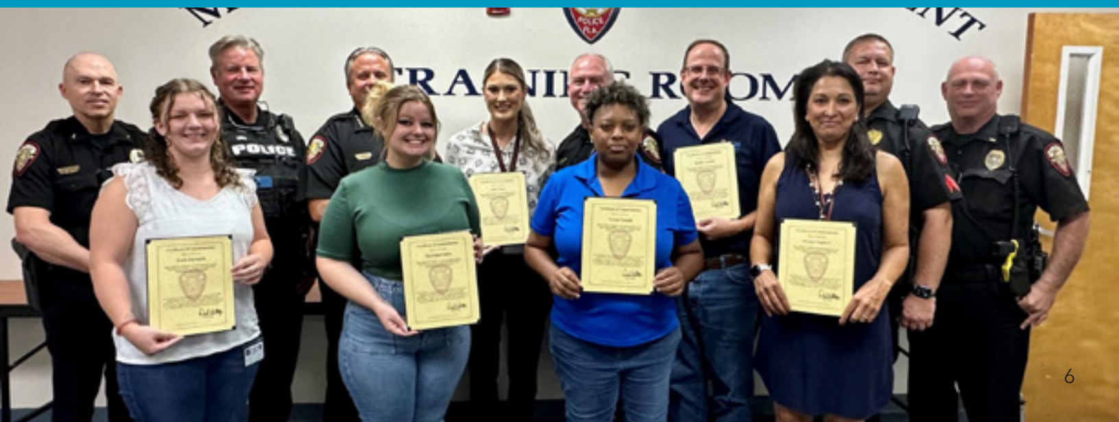
Mobile Crisis Co-Responder Team

Construction of the new police facility, the Joseph Pellicano Law Enforcement Center, progressed significantly in 2023. The facility is on schedule to be completed and occupied in 2024. The new 76,390 square-foot, two-story building will bring all MPD divisions together under one roof to help make emergency response more efficient and to streamline operational efficiency and information sharing.