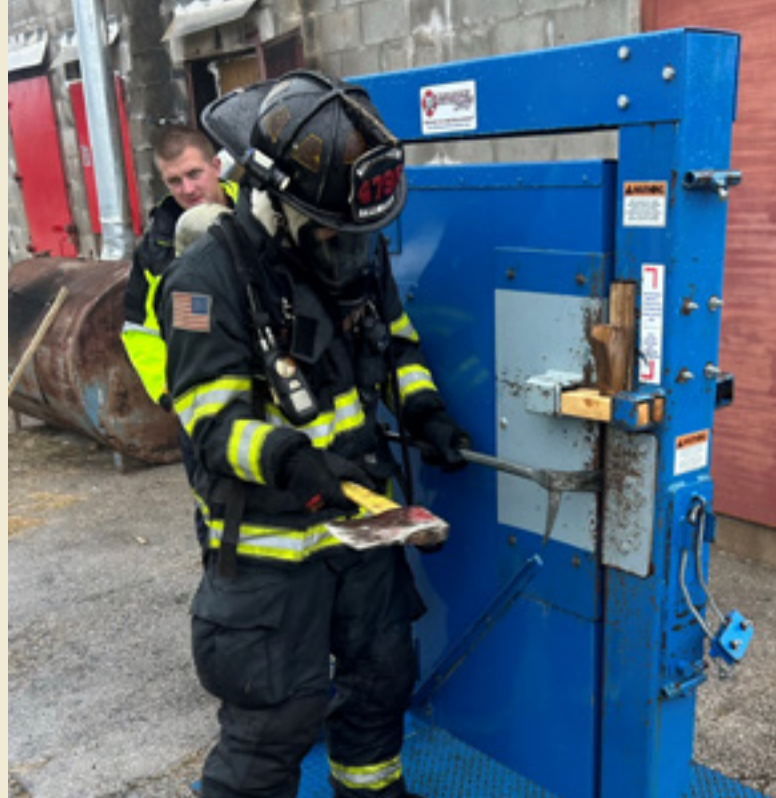
Melbourne Fire Department Fire Training Center