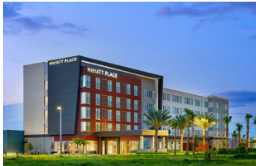
Hyatt Place at Melbourne Orlando International Airport