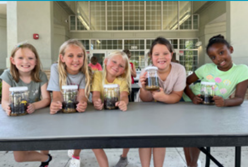
Wickham Park Community Center Summer Camp