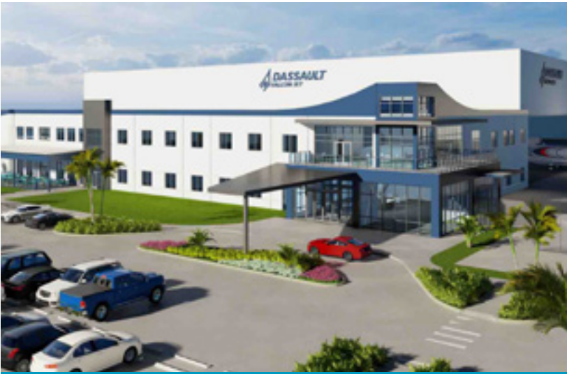
Dassault Falcon Jet Complex (architectural rendering)

In January, the Melbourne Orlando International Airport completed its terminal expansion project featuring an expanded concourse with fresh restaurant and retail concessions; expanded, streamlined TSA security screening area; four new common-use international/domestic jet bridges; renovated common-use ticketing area and counters; expanded U.S. Customs Federal Inspection Station; and a new welcome center with immediate access to ground transportation, including an attached bus depot.