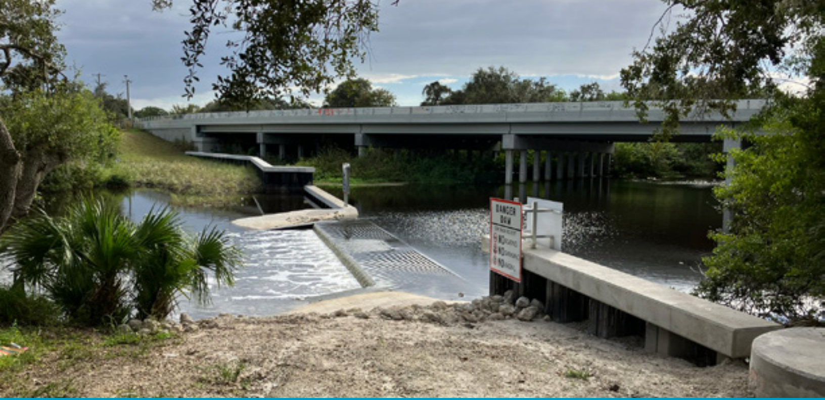
Eau Gallie River Dam

In 2023, construction began on a new pumping station at Canova Beach to improve energy efficiency and pumping in the City's water distribution system on the barrier island. The work includes a new chemical storage and feed system with a canopy structure, a new electrical building, new electrical service including on site pad-mounted transformer, new electrical equipment and associated instrumentation and controls. Once the improvements are placed into operation, the existing pump station and electrical building will be demolished. The existing 2 million gallon ground storage tank is in good shape and will stay in service.