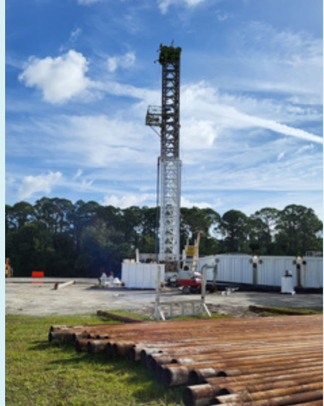
Deep Injection Well Drilling Rig

Two isolation valves were installed on the water transmission main that runs under U.S. 192 near Campbell Drive. Adding