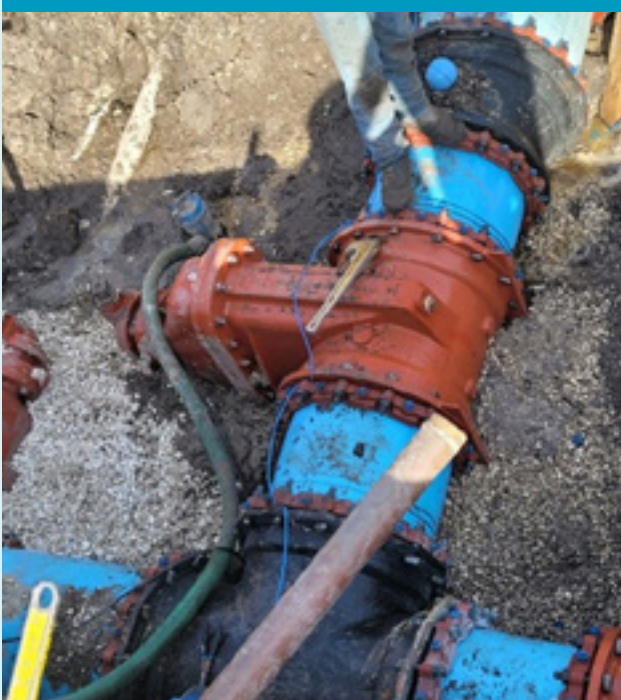
Isolation Valve Installation

A project to expand the City of Melbourne's reverse osmosis (RO) groundwater production plant continued to progress. Construction began on a deep injection well to dispose of the concentrate that is part of the RO water treatment process. Work to replace and upgrade the RO plant's degassifiers and scrubbers (key components necessary in the RO treatment process) also continued. At the surface water treatment plant, a project to improve piping on the surface water treatment filters began. When completed the new piping will make the process to clean the filters more efficient.