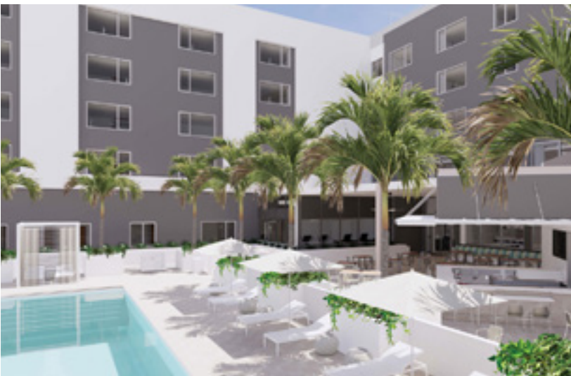
Element Melbourne Oceanfront Hotel (architectural rendering)

Toward the end of 2023, Council gave conceptual approval of a proposed public-private development agreement that would redevelop the blighted property at 2100 Melbourne Court into an $80 million project with a 246 market-rate apartments. Under the proposed plan, the developer would donate approximately 0.491 acres of land to the City of Melbourne upon completion of the project that the City could use to create a large public leisure area and event space that would connect Downtown to the waterfront.