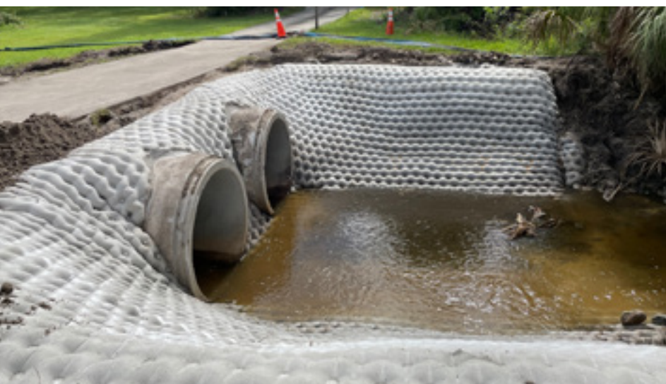
Villa Espana Stormwater Ditch Improvement Project

In Fiscal Year 2023, more than 174 cubic yards of debris were removed from the City's 16 baffle boxes. The street-sweeping program cleaned up 854,233 pounds of litter and debris from City streets, and Adopt a Road volunteers removed another 8,560 pounds of trash. The City's ECO Division also coordinated volunteer trash clean up events – like Trash Bash and International Coastal Cleanup – that engaged residents in the effort to help restore the Indian River Lagoon.