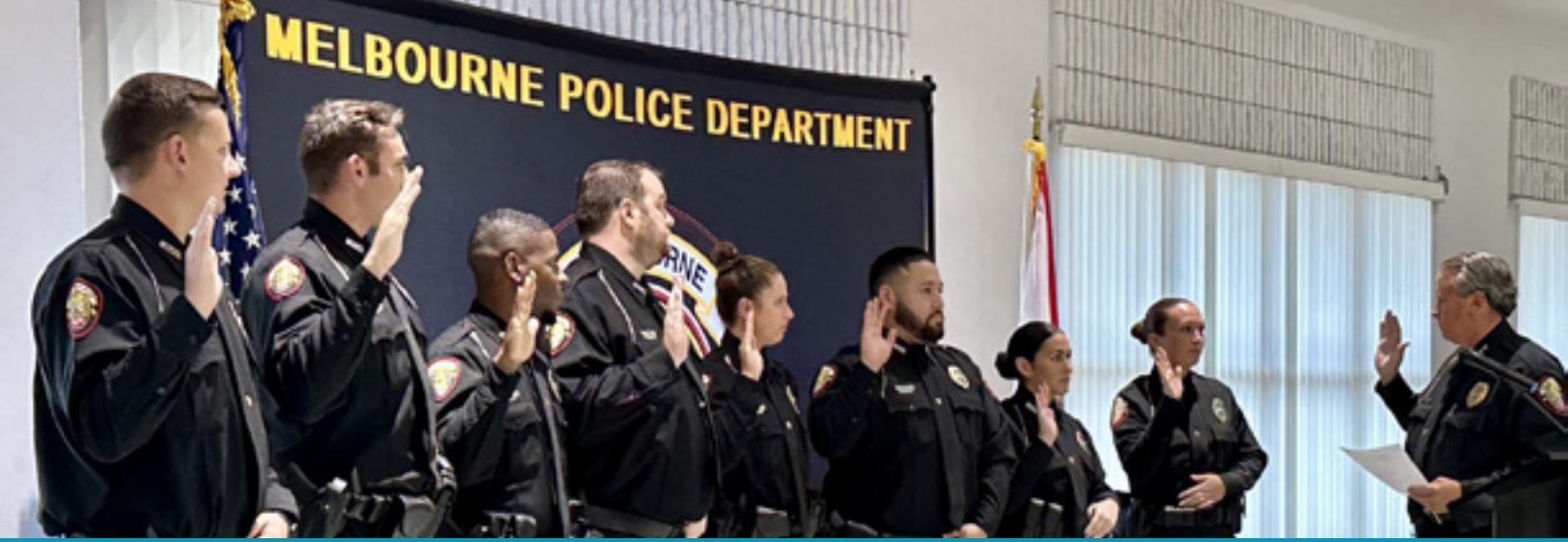
Melbourne Police Department Swearing-In Ceremony