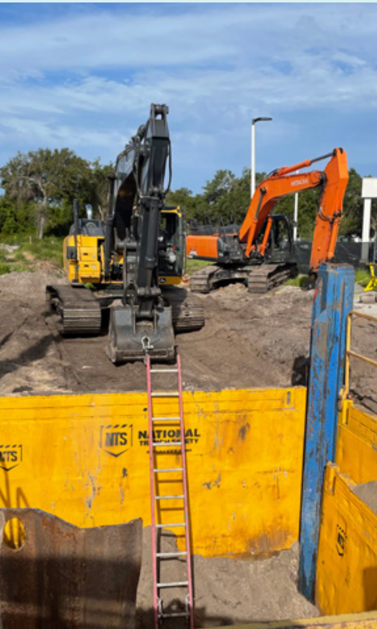
Drainage Improvements Project at 1046 S. Harbor City Boulevard

A smaller drainage pipe was replaced with a 5' x 5' box culvert system at 1046 S. Harbor City Boulevard to improve drainage throughout a large area that includes Melbourne High School and Holmes Regional Medical Center. This project has not only alleviated localized street flooding, it is reducing sedimentation caused by erosion from entering the Indian River Lagoon.